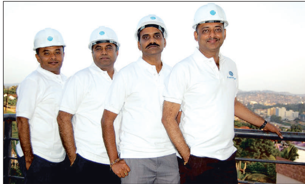
The Visionaries Turning Ambition into Achievement